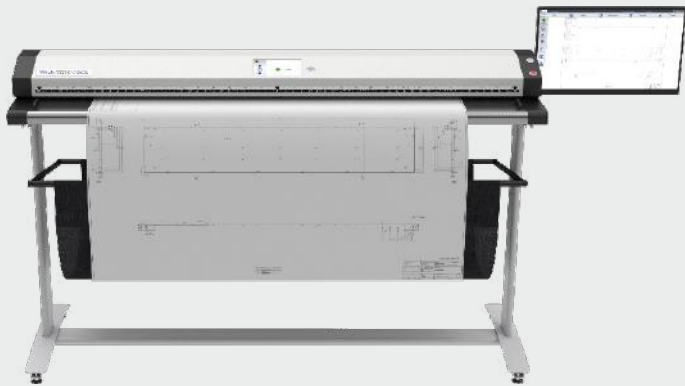
Large documents like maps rewind to the front or fall into the paper catch.

The WideTEK® 60CL produces extraordinarily sharp images, with color accuracy even superior to competing CCD scanners. Document rotation is done on the fly, a scan of an E-sized / A0 document in landscape at 300 dpi in 24bit color takes less than 7 seconds to scan and another 2 seconds to crop & deskew, preview and store.